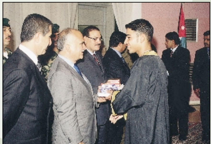
The Prince honoring one of the students

At the end of the ceremony, the Prince presented students with gifts in appreciation of their achievement.