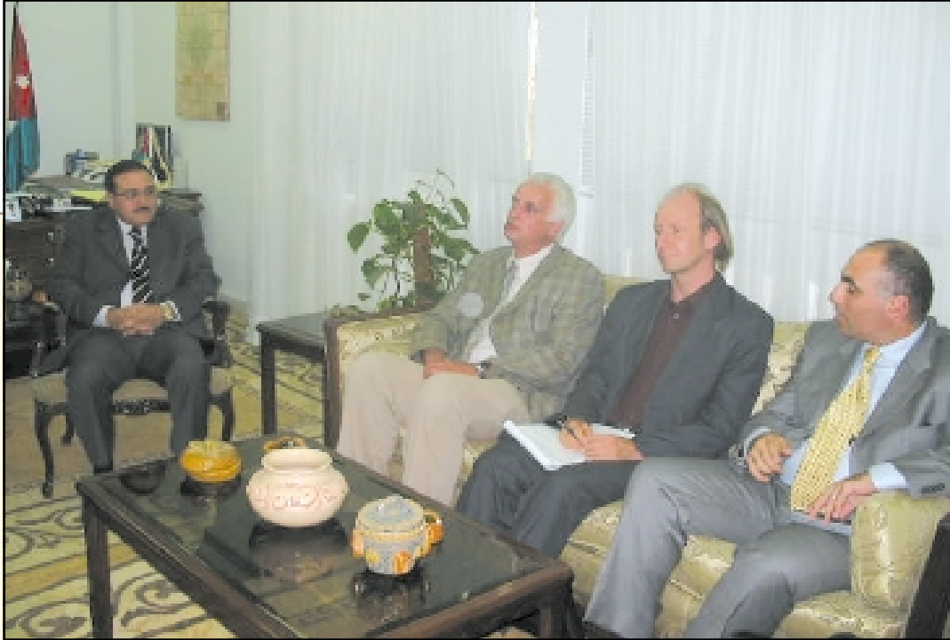
Part of the visit