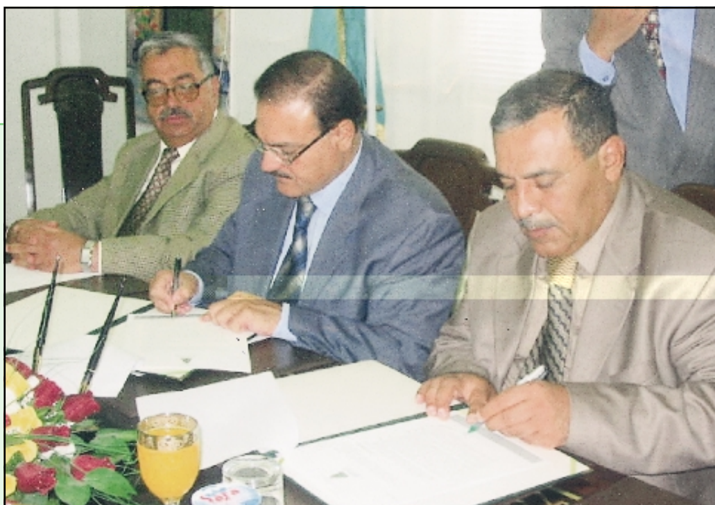
The signing of the MOU

A Memorandum of Understanding (MOU) was reached between AL al-Bayt University and the Iraqi Geological Syndicate on August 21, 2005 providing for joint collaboration in earth and environment-related sciences.