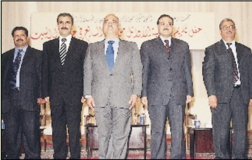
Part of the ceremony