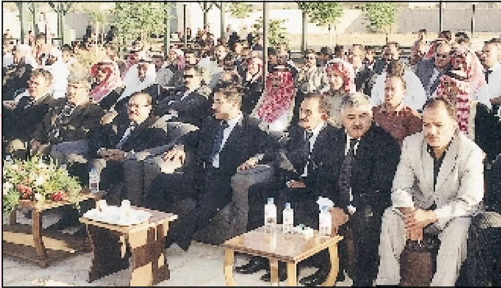
Part of the ceremony

AL al-Bayt University organized on August 15, 2005 a ceremony to pay tribute to pioneers of voluntary work, heads of municipalities in the Governorate of Mafraq, and families of martyrs in the Za'tari town of Mafraq.