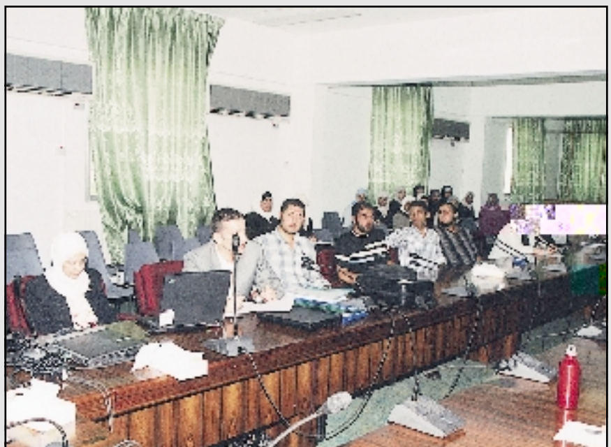
Part of the seminar

Paramount among these activities is to prepare youth for Jordan's knowledge economy by enhancing the secondary level MIS curricula, developing MIS e-Learning modules, training MIS teachers, facilitating decisions on standards and piloting a school-to-work transition program. By working closely with schools and the private sector, the program will help make the MIS program relevant to the needs of youth and businesses.