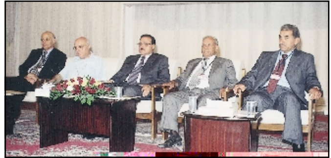
The inauguration of the conference