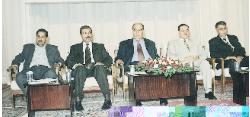
The inaugural session