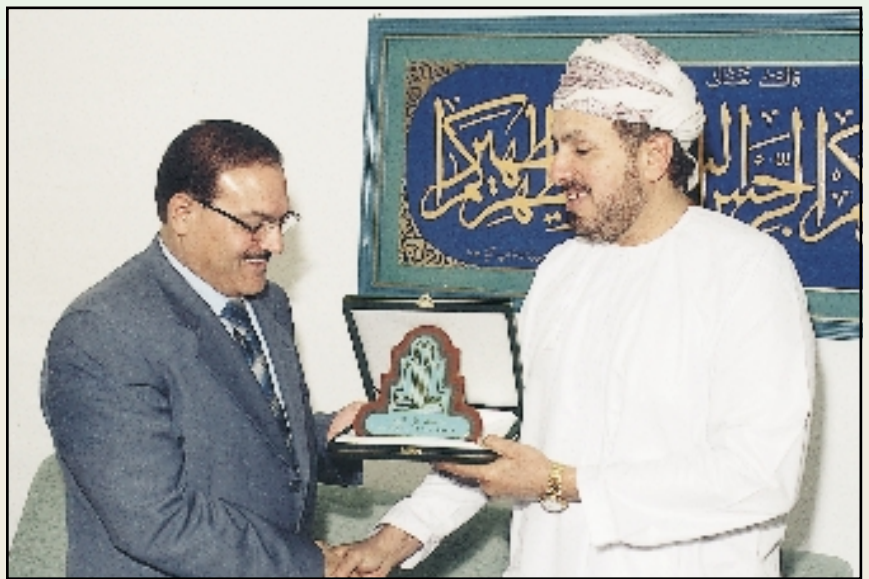
Part of the farewell