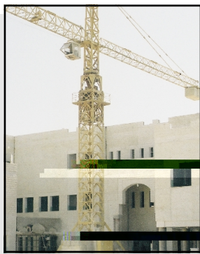
Bani Hashem Teaching complex