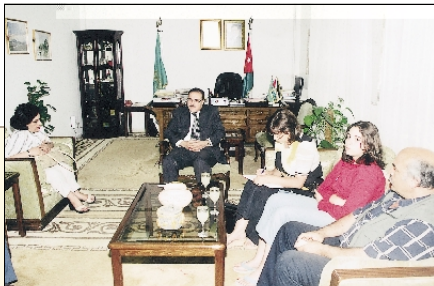
The Bulgarian guest exploring relations