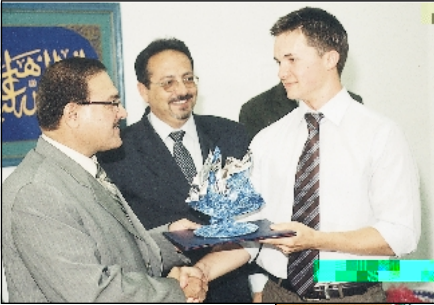
The graduation ceremony of American students who attended Arabic language courses at the Language Centre during the summer