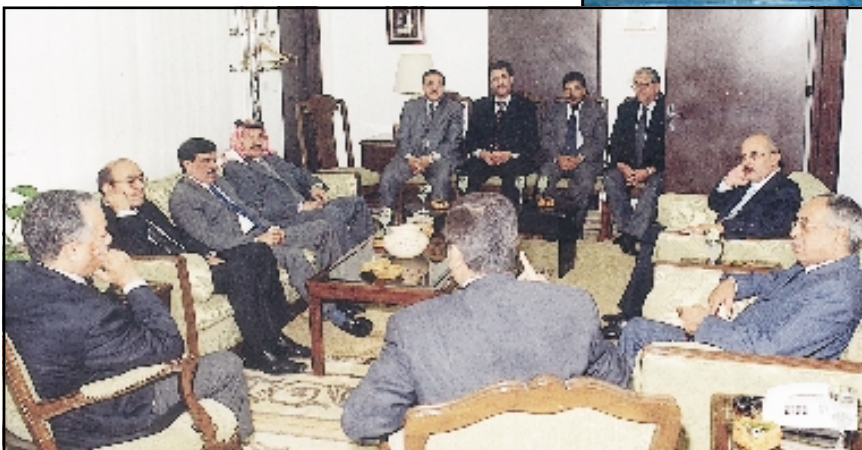
Part of the President's meeting with key officials and notables from the city of Mafraq