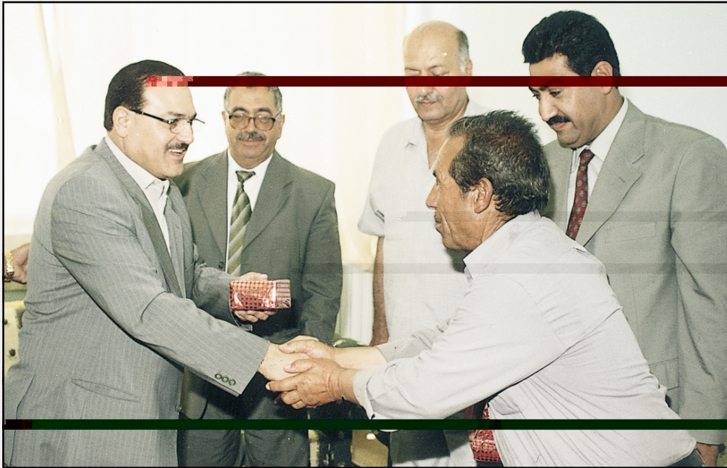
Paying tribute to staff