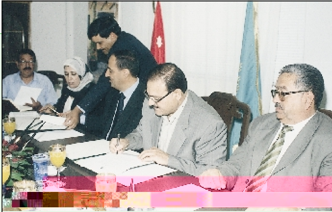
The signing ceremony

An Agreement was signed recently between AL al-Bayt University and Haj Mohammad Taha Al-Harahsheh Institution relating to the allocation of a number of scholarships for needy students from the University.