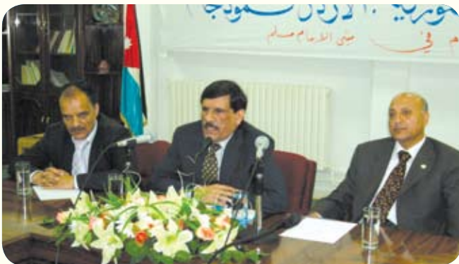
His Excellency, Saad Hayel Sroor lectures on the Constitutional Monarchy at Al-al-Bayt University.