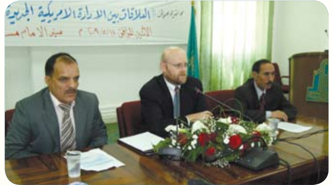
A lecture entitled 'The relationship between the new U.S. administration and U.S. Congress'.