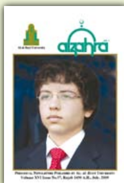
Crown Prince, His Royal Highness Prince Hussein bin Abdullah