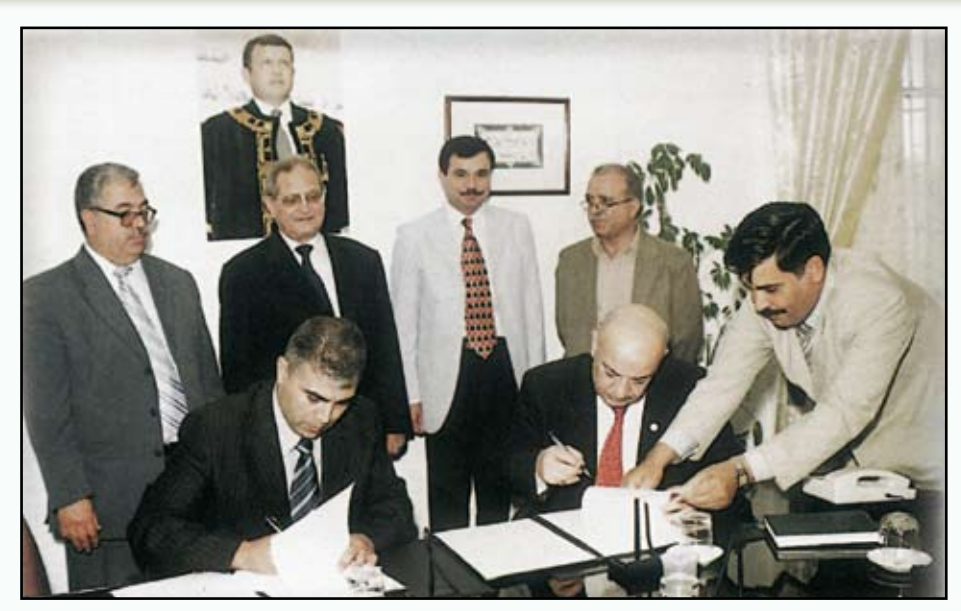
The signing ceremony

A Memorandum of Understanding was reached last August between AL al-Bayt University and the National Center for Agricultural Research and Technology Transfer (NCARTT) with the objective of serving the purposes of agricultural research in Jordan.