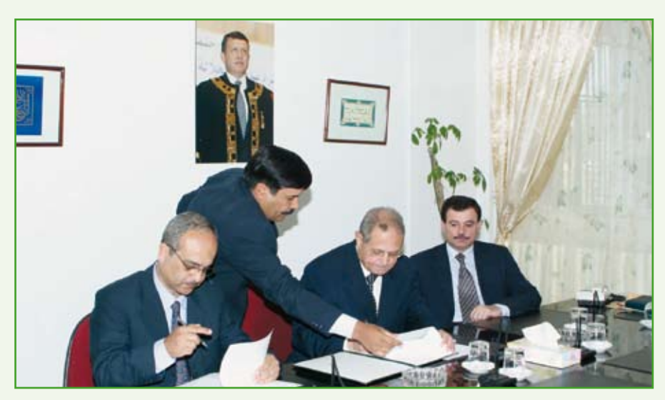
The signing cermony

A Memorandum of Understanding was reached between AL al-Bayt University and Biblioislam, the academic site for "Islam Online" website.