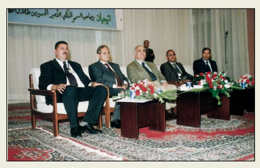
The inauguration session

Under the patronage of His Royal Highness Prince El-Hassan Bin Talal, AL al-Bayt University organized: "The Second Conference on Environmental, Natural and Touristic Resources and Their Role in Developing Economic Investment in Jordan."