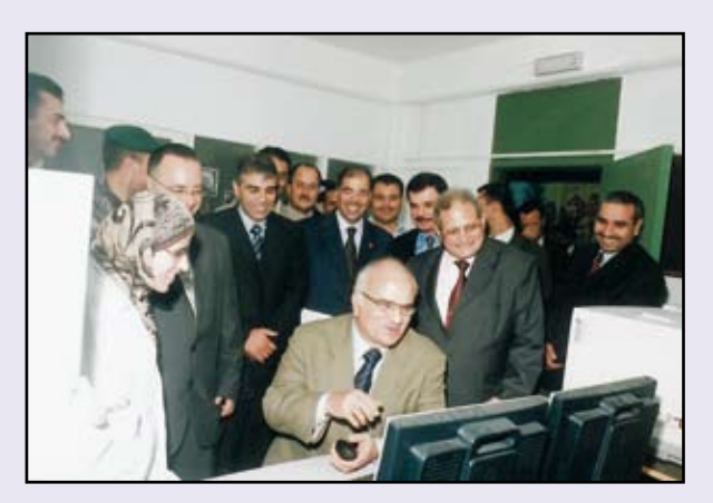
Prince El-Hassan inspecting Language Labs

His Royal Highness Prince El-Hassan urged students attending Arabic for Non-Native Speakers of the Language (ASOL) to participate effectively in all activities that foster human and friendly relationships with counterpart colleagues representing varied backgrounds and myriad cultures.