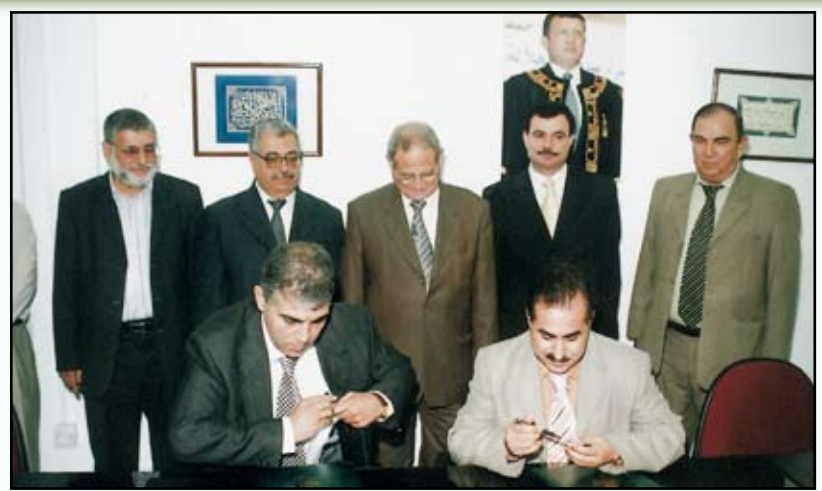
The signing ceremony

AL al-Bayt University and the Jordan Environment Society/Mafraq Branch signed a Memorandum of Understanding on October 16, 2007, paving the way for close cooperation in environment-related activities and studies.