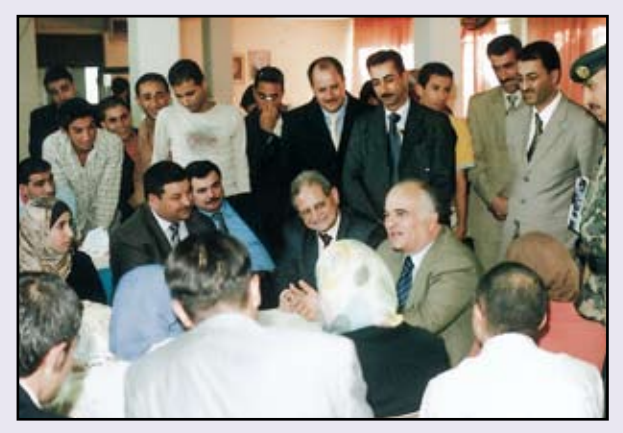
Prince El-Hassan holding informal discussions with students