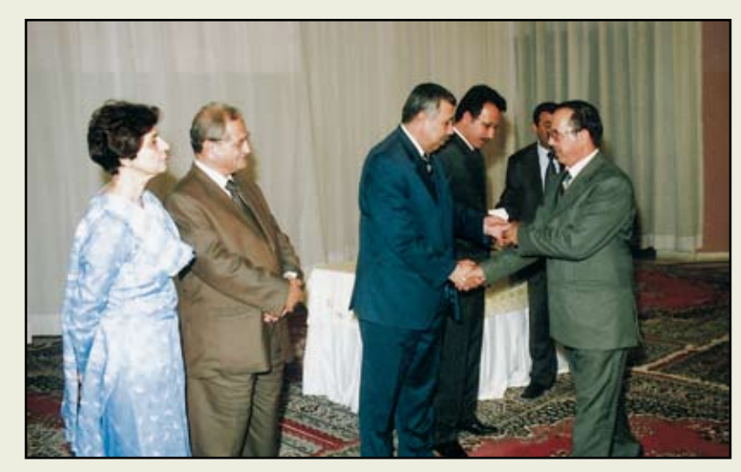
Part of the celebration

Adult education and illiteracy centres (introduced in 1952) as well as mandatory