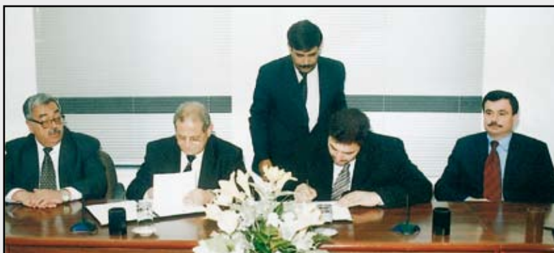
The signing ceremony of the agreement