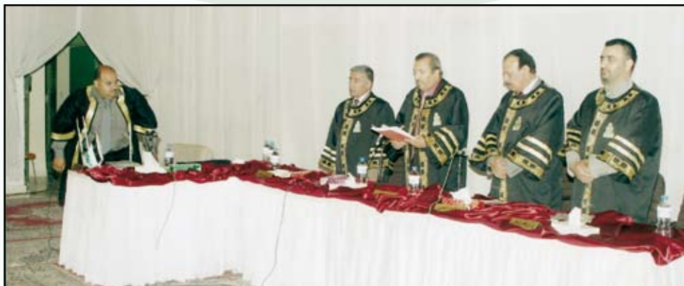
The viva voce examination of the student