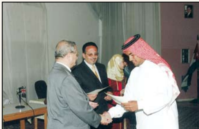
The Language Center celebrating Jordan's Independence Day