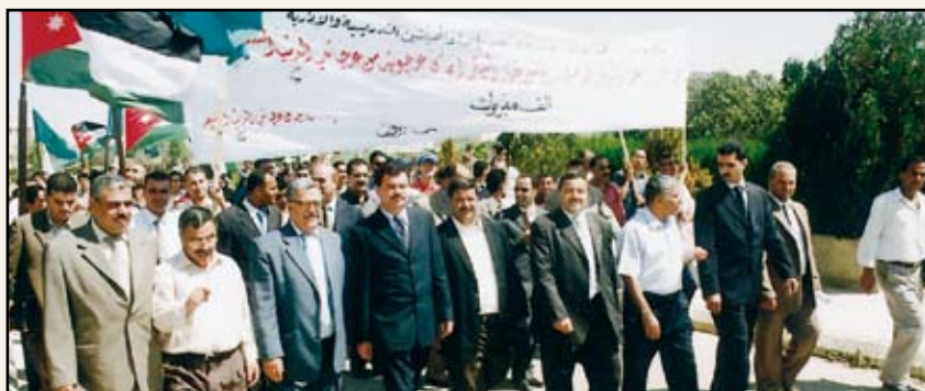
The rally celebrating Petra announcement as one of the New Seven Wonders of the World

AL al-Bayt University rejoiced over Petra's selection as one of the "New Seven Wonders of the World," celebrating its victory with rallies that toured the campus. Students chanted songs and danced folkloric dances in honor of this monumental city.