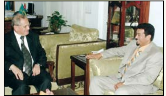
Part of the visit of the Kuwaiti Cultural Attaché