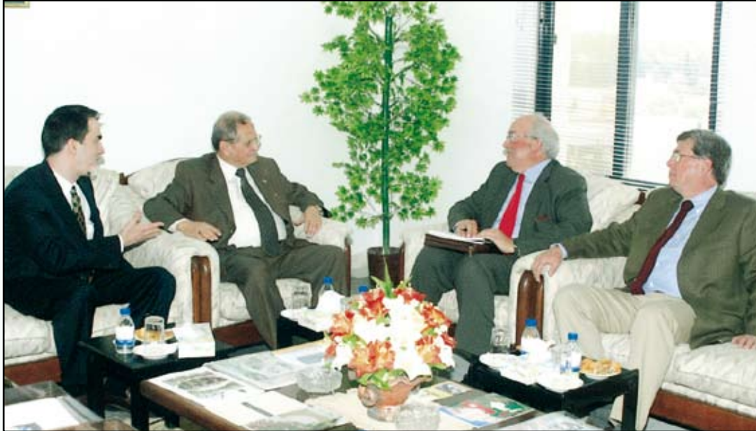
Discussions with the American educationalists