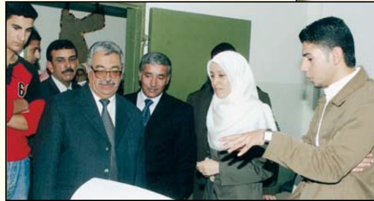
The Faculty of Education celebrates its scientific day