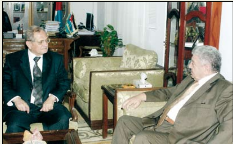
Discussions with the Azeri Ambassador