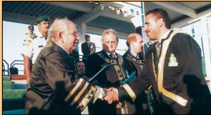
Prince Ra'ad presenting a graduate with his certificate