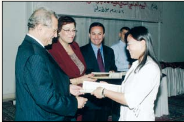
The inauguration of the Scientific Day

On May 20, 2007, the Faculty of Arts and Humanities (FAH) celebrated its second Scientific Day.