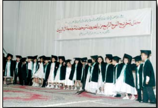
The graduation of children attending the Day Care Center