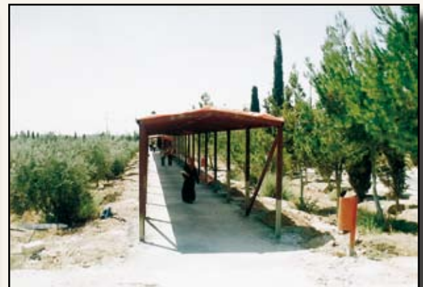
Shaded streets on campus