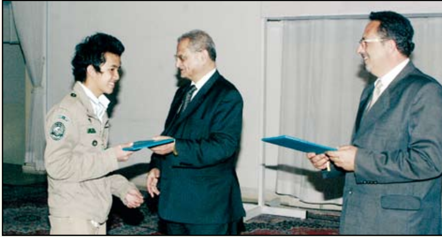
An Indonesian graduate