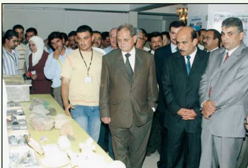
The inauguration of the Scientific Day