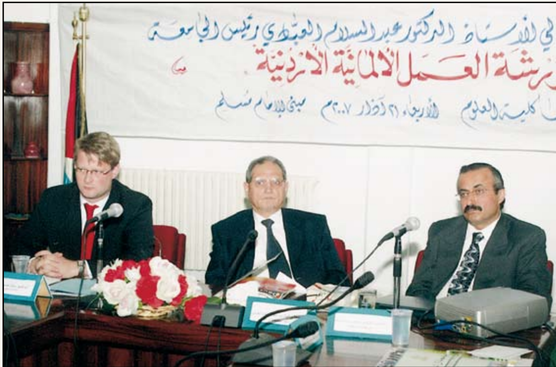
Discussions of Muslim integration in Germany

On July 10, 2007, the Faculty of Economics and Administrative Sciences organized an open dialogue on: “Difficulties Encountering Arab-European Relations.”