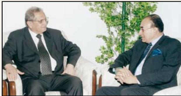
Discussions with Advisor to Indonesian President