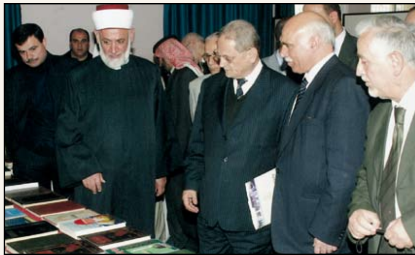
The Faculty of Islamic Jurisprudence and Law marking Prophet Mohammad's Birthday Anniversary