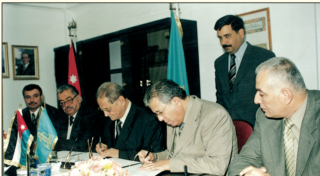
The signing ceremony

A Memorandum of Understanding (MOU) was reached between AL al-Bayt University and the Civil Service Consumer Corporation on November 6, 2006. Under this MOU, AL al-Bayt University pledges to provide technical support and administrative consultation for the Civil Service Consumer Corporation to help it compete for King Abdullah Award for Distinction in Government Performance.