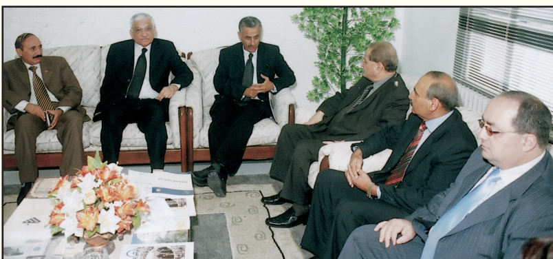
Discussions with the Kuwaiti University delegation