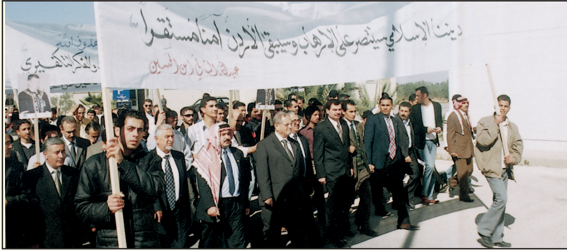
Part of the march

With a deep sense of sadness, AL al-Bayt University students held a march on November 9, 2006 , to mark the first anniversary of the tragic bombings of three Amman hotels which claimed the lives of some 60 people.