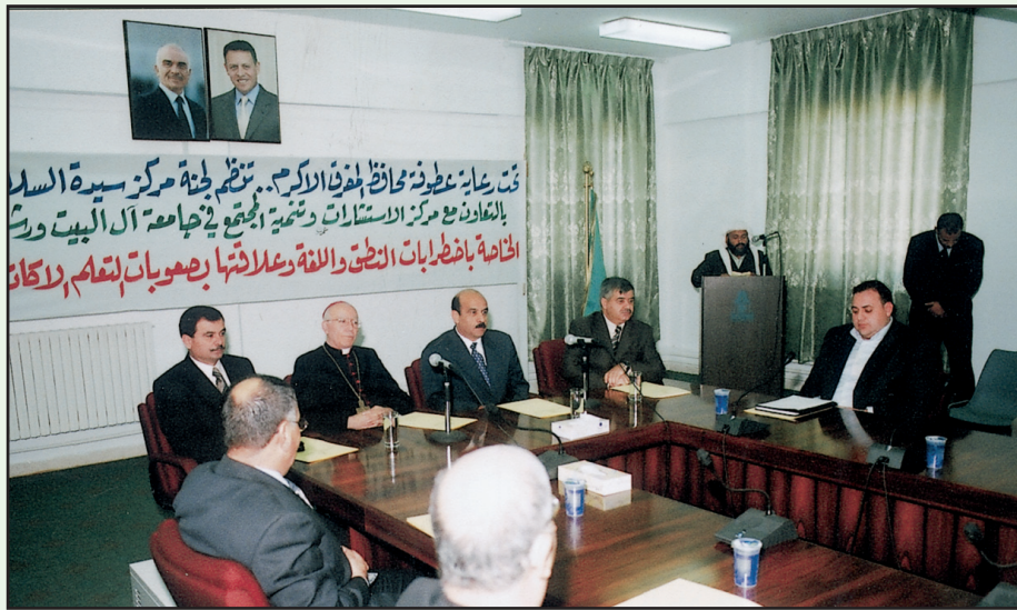
Part of the workshop

In cooperation with the Committee of Our Lady of Peace Centre which is affiliated with the Latin Patriarchate in Jordan, AL al-Bayt University Center for Consultation, Technical and Community Services held a workshop on November 16, 2006, entitled: "Language and Speech Disorders Amongst School Students and their Relationship with Academic Difficulties and Progress."