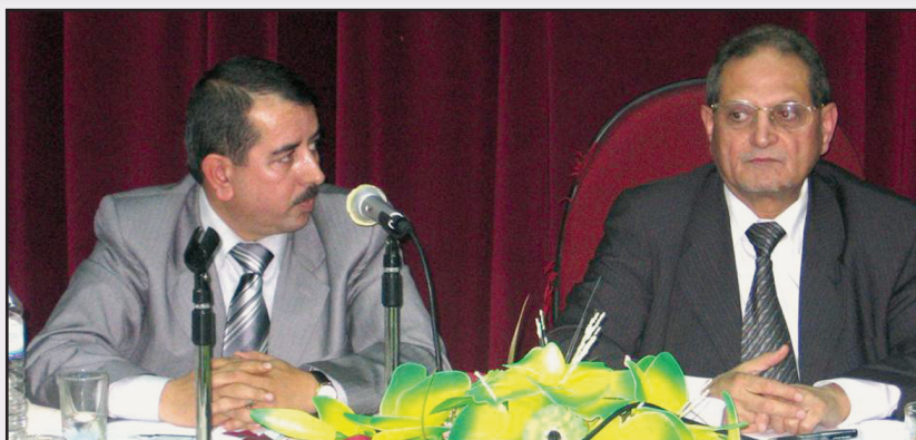
Part of the lecture