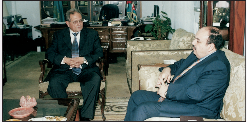
Part of the visit

The two sides also discussed arrangements for an international conference on moderation to be held between November 17-19, 2007 in Washington,