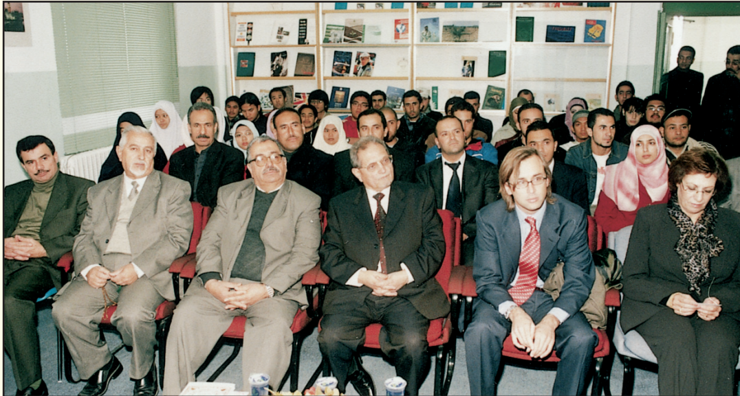
Part of the celebration

Al al-Bayt University witnessed on November 15, 2006, the inauguration of the Italian Cultural Day which was organized by the University's Language Centre and Department of Modern Languages in collaboration with the Italian Embassy in Amman.