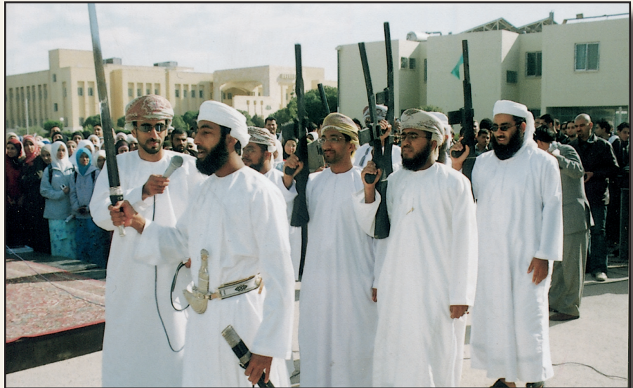
Omani students performing their folklore dance