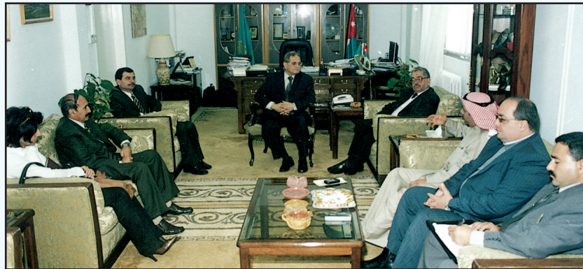
Part of the visit