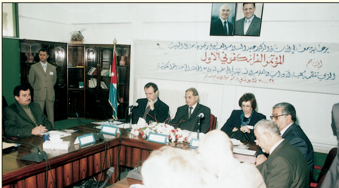
The inauguration session