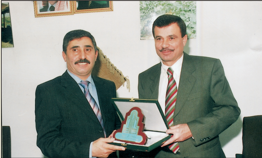
The signing ceremony

Under this Agreement of Cooperation, and in its capacity as a regional centre for training in the northern area of the Kingdom, AL al-Bayt University is to prepare training courses for personnel from the Ministry of Agriculture on topics pertaining to ICDL, TOEFL, etc.