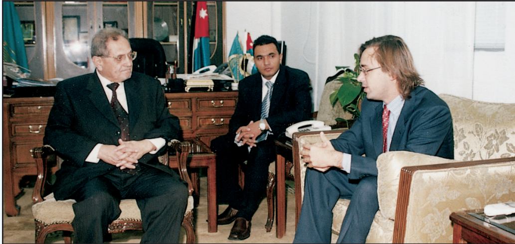
Discussions with the Italian Cultural Attaché