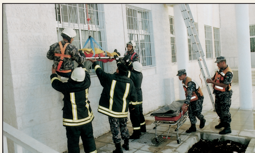
Fictitious fire practice