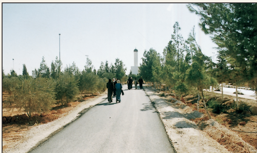
The opening of side alleys and walk streets for students within the University campus