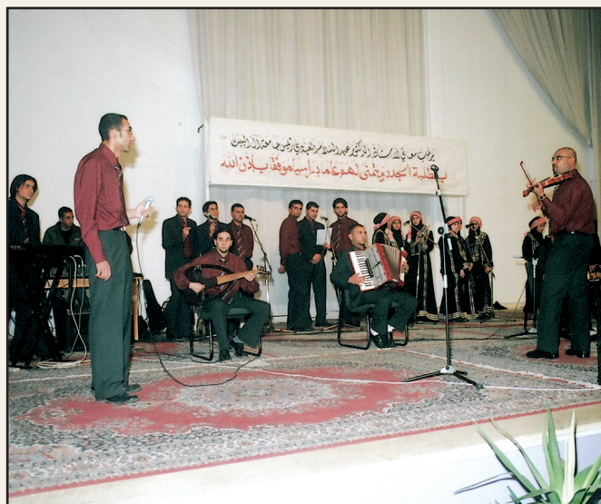
Student celebration to mark the new academic year